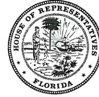
WILL WEATHERFORD Speaker of the House of Representatives